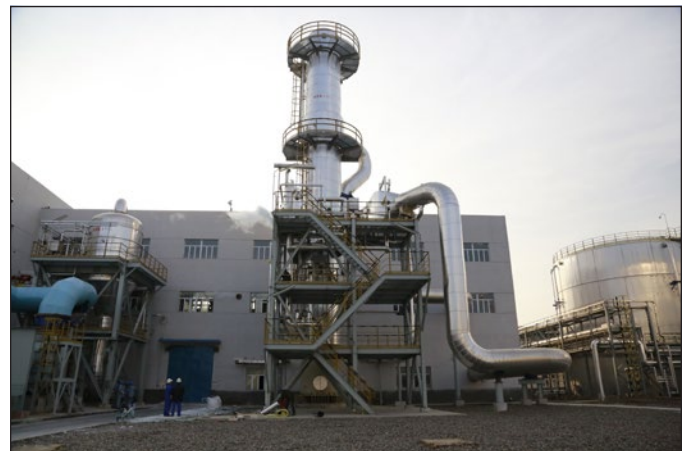
Aquatech ZLD System in China

certainly relate to the Internet of Things (IoT), big data and intelligent water systems. This covers every element of the water cycle, from the reserve to the drinking water distribution system to the wastewater treatment plants to how the consumer uses the water. Change happens faster than we sometimes think, and water is like an open economy that is affected by macro-level changes and we are not isolated from them.