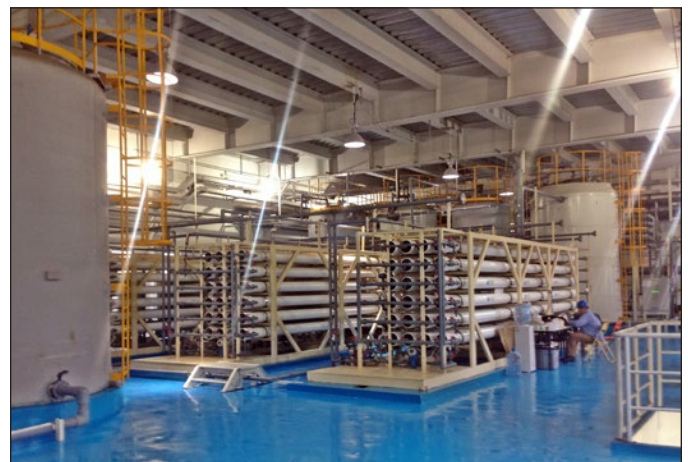
Forward Osmosis skids

To help analyze trends in big data and make sense of it, we leveraged BlueTech Semantic Analysis tools to analyze conference paper texts in 2016 with those from 2015. The following are examples of two trends that emerged.